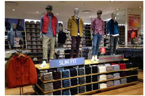
GLENDALE GALLERIA Glendale. CA