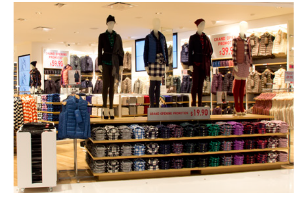
SOUTH COAST PLAZA Costa Mesa, CA