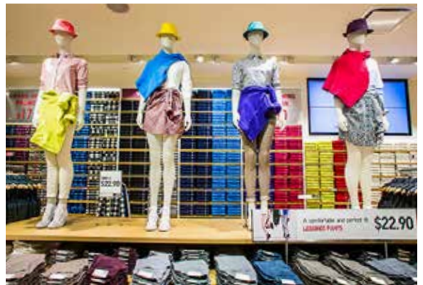
BEVERLY CENTER Los Angeles, CA