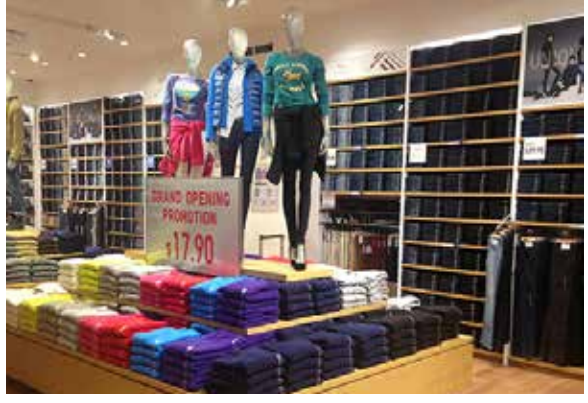
NORTHRIDGE FASHION CENTER Northridge, CA